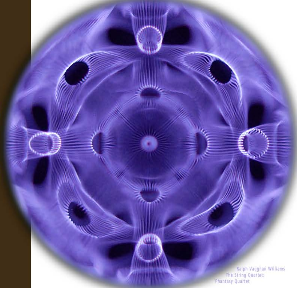
Ralph Vaughan Williams The String Quartet: Phantasy Quartet

CYMASCOPE® S O U N D M A D E V I S I B L E